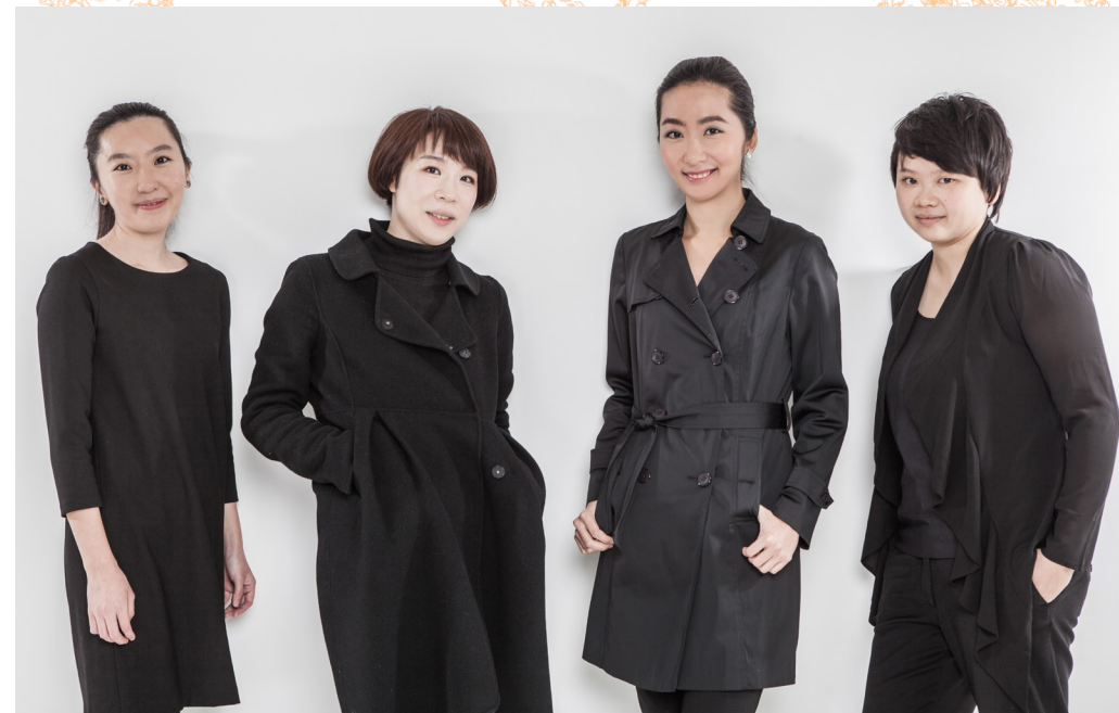
DAWNING QUARTET 當聆四重奏